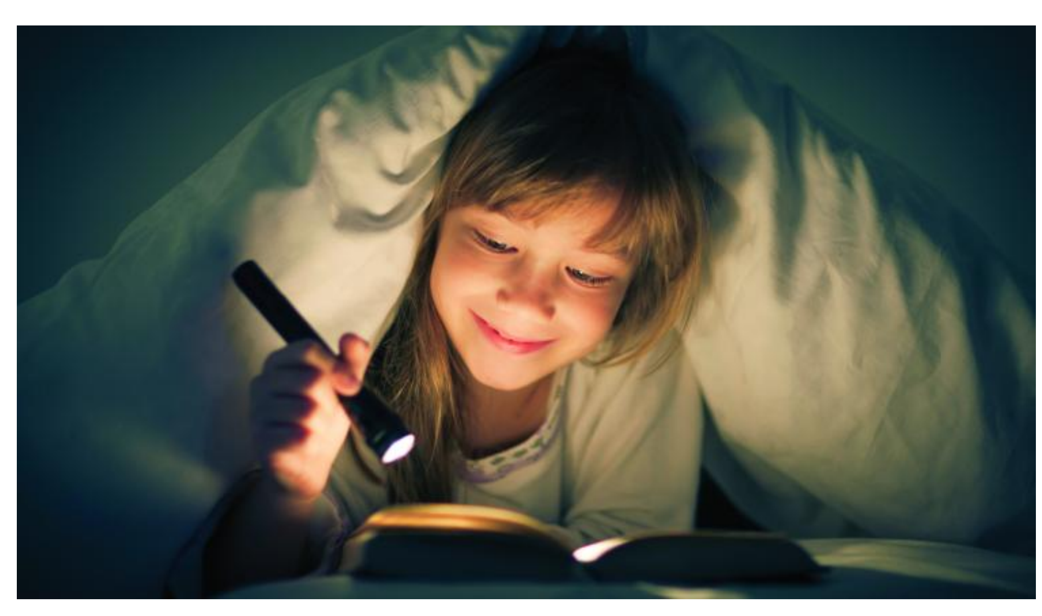
English (/news/school-news/english) | Literacy (/news/school-news/literacy) | Primary (/news/school-news/primary)

TES and the National Association for the Teaching of English ran a survey to find teachers' top 100 fiction books all children should read before leaving primary school. Here are the results.